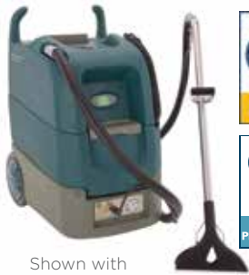
Shown with Titanium wand